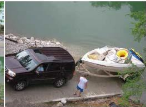
4. Pull down to the water and put the boat in.