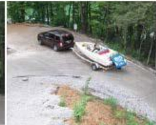
3. Turn towards red house, . . . pull forward towards the house, . . . then start backing down the ramp.