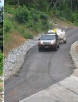
2. Come down driveway forwards and go towards red house