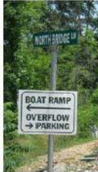
1. Keep to the left, then left at sign

Once you enter Lakeside Estates, either park your boat/trailer up by the pool in the overflow lot (on your left as you are driving towards Blue Water Lane), or take a left at Waterfront trails before you get to the pool/overflow lot and that will take you directly to the boat ramp. Your trailer can be parked in the overflow lot up by the pool during your stay. We recommend locking your trailer.